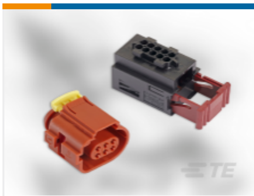
TE Part #929505-5 TIMER, CONNECTOR HOUSING