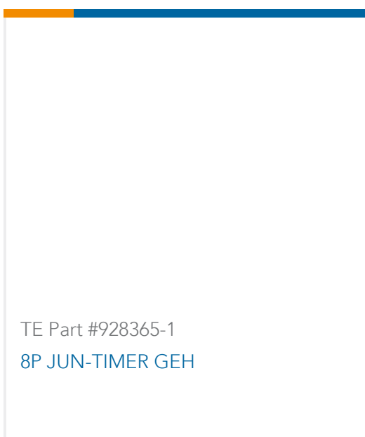
TE Part #928365-1 8P JUN-TIMER GEH