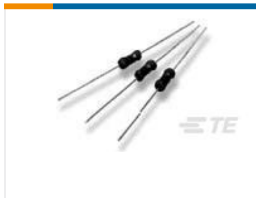
TE Part #4-1879354-6 RR03 5% 24R AMMO