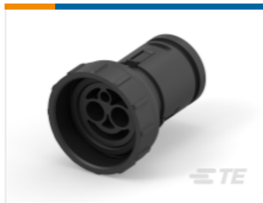
TE Part #100284-1 2P.4MM SOCK.ASS.M27