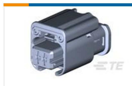
TE Part #1801176-5 2W RECEPTACLE HP SL CONNECTOR GREEN