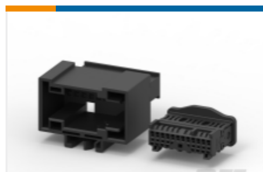
TE Part #1379729-1 MQS, CONNECTOR HOUSING BLACK