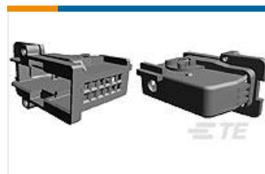
TE Part #1379100-2 COV+LEV MQS 18W 0DEG WHI