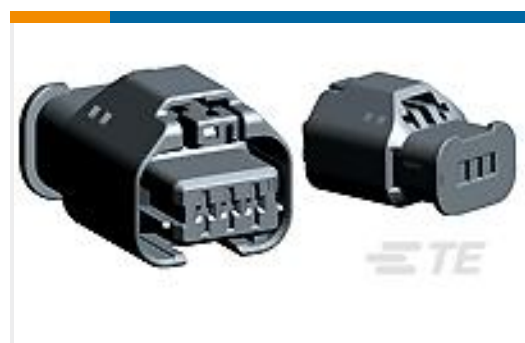
TE Part #1801178-1 3W RECEPTACLE HP CONNECTOR BLACK