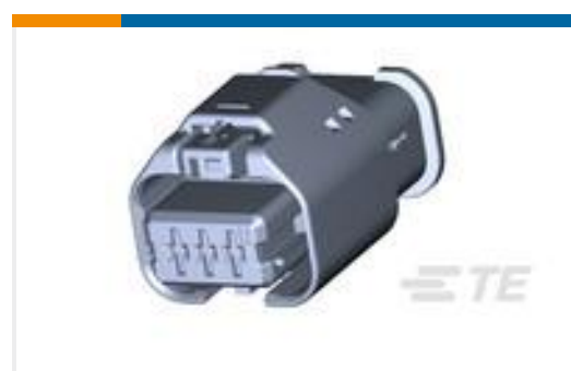
TE Part #1-1801178-2 3W RECEPTACLE HP CONNECTOR BLUE