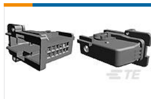
TE Part #1379100-1 COV+LEV MQS 18W 0DEG BLK