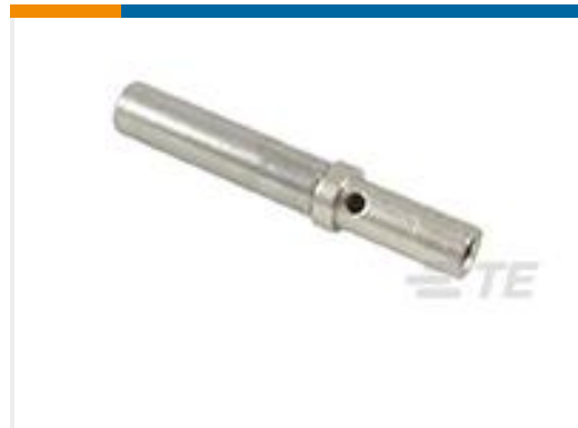
TE Part #0462-201-16141 SOC, SOLID, SIZE 16, 16-20AWG, NI