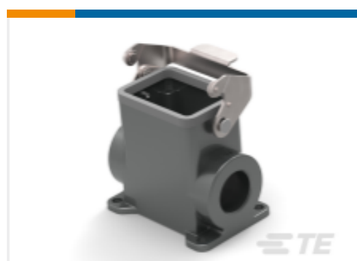
TE Part #T1650062121-000 H6B-SGRHS-PG21