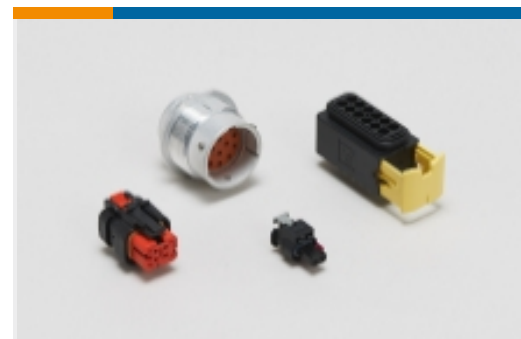
Automotive Housings (619)