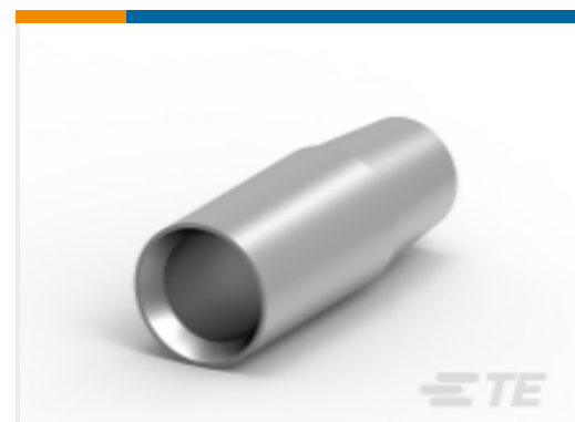
TE Part #YHC5933000000000000 BATTERY LEAD CONNECTOR.35MM.-VE.M6 THRD.