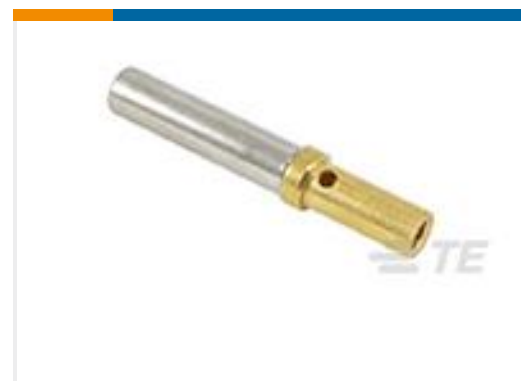
TE Part #0462-201-1631 SOC, SOLID, SIZE 16, 16-20AWG, AU