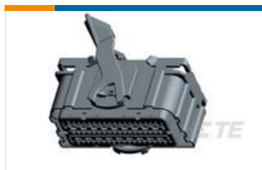
TE Part #2-2098922-5 SDM,54P PLUG ASY,RHL,KEY B