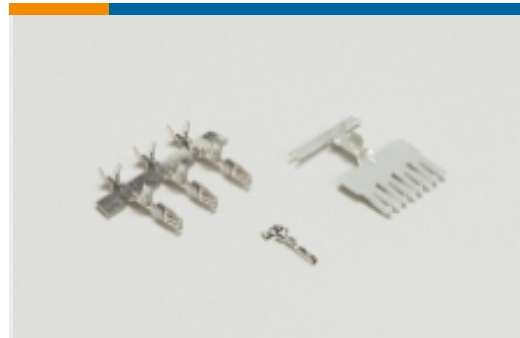
Busbars & Terminals(3)