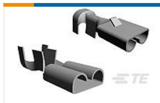
TE Part #280095-2 FF 250 REC 0.3-0.8MM2 PTBR