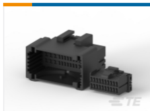
TE Part #1897552-1 MULTILOCK, CONNECTOR HOUSING