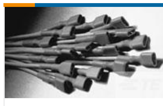
TE Part #5913836032 LSTT-6.4-0-30MM