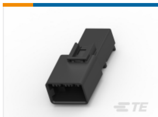
TE Part #1897198-2 MCP 9.5 2P CAP HSG