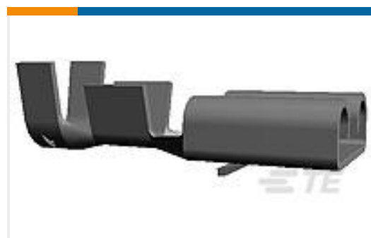
TE Part #160914-2 FF 250 REC 4-6MM2 TPBR