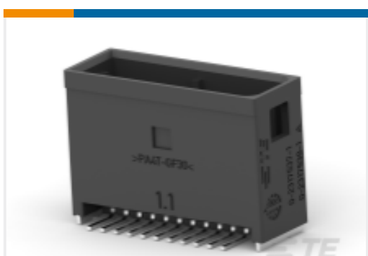
TE Part #2317537-1 2X11POS,NANOMQS,ASSY,180DEG, SMD,COD A