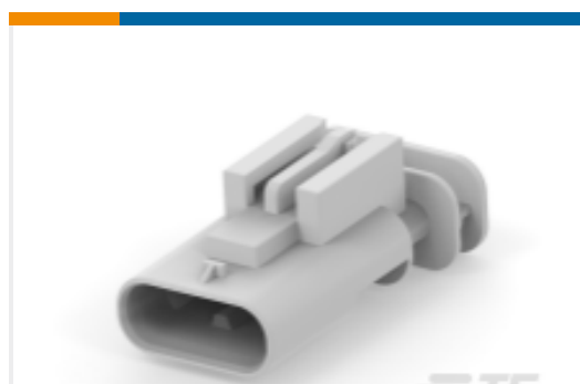
TE Part #2-1564559-2 4POS, MCON 1.2 LL TAB SEALED COD B