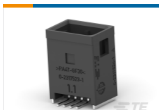
TE Part #2317523-1 2X4POS,NANOMQS,HDR ASSY, 180DEG,SMD,COD A