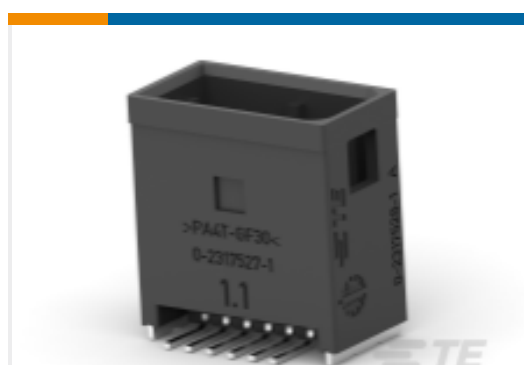
TE Part #2317527-1 2X6POS,NANOMQS,HDR ASSY, 180DEG,SMD,COD A