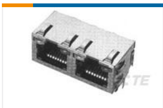
TE Part #6368419-1 INV MJ,1X2,PNL GRD,LED (G/Y)