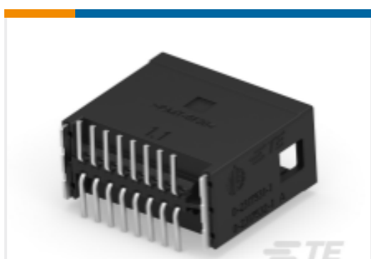
TE Part #2317531-1 2X8POS,NANOMQS,HDR ASSY, 180DEG,SMD,COD A