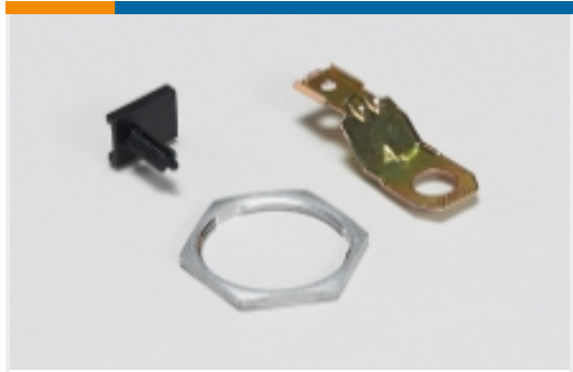
Other Automotive Connector Accessories(13)