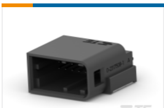
TE Part #2317507-1 2X6POS,NANOMQS,HDR ASSY, 90DEG,SMD,COD A