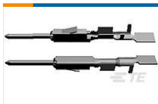
TE Part #6-928918-2 MQS0,63 Au tab LL unseal. 0,2-0,35