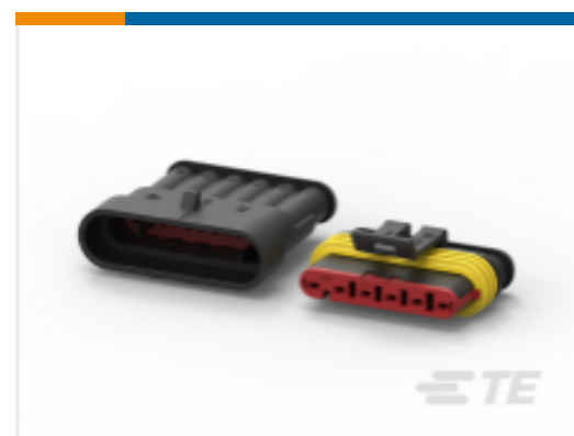
TE Part #282108-1 AMP SUPERSEAL 1.5MM, CONNECTOR HOUSING