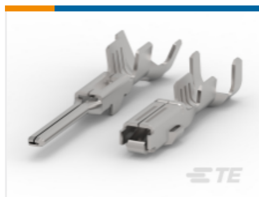
TE Part #183024-1 AMP SUPERSEAL 1.5MM, RECEPTACLE AND TAB