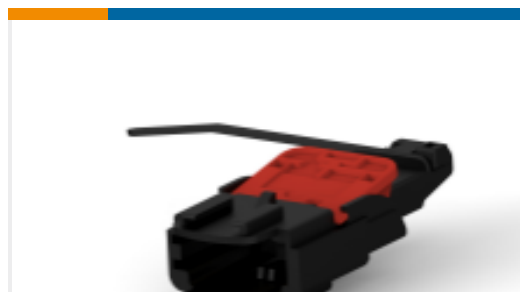
TE Part #2-953733-1 4W MCP TAB HSG LV ASSY