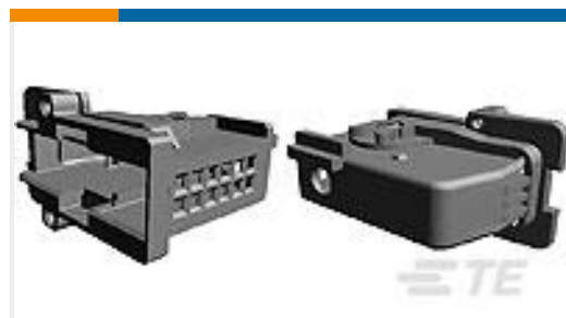
TE Part #1379100-2 COV+LEV MQS 18W 0DEG WHI