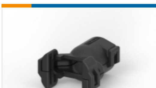
TE Part #2272168-1 MCON WIRE DRESS, 2P PLUG, STRAIGHT