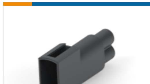
TE Part #2-1437712-5 NP1WA-0002XX=CONN. 2W FEMA BLK