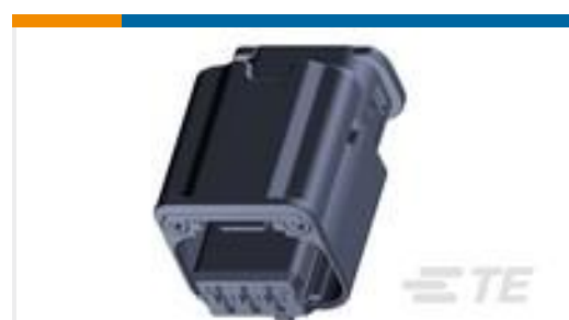
TE Part #1801179-2 3W RECEPTACLE HP SL CONNECTOR BLUE