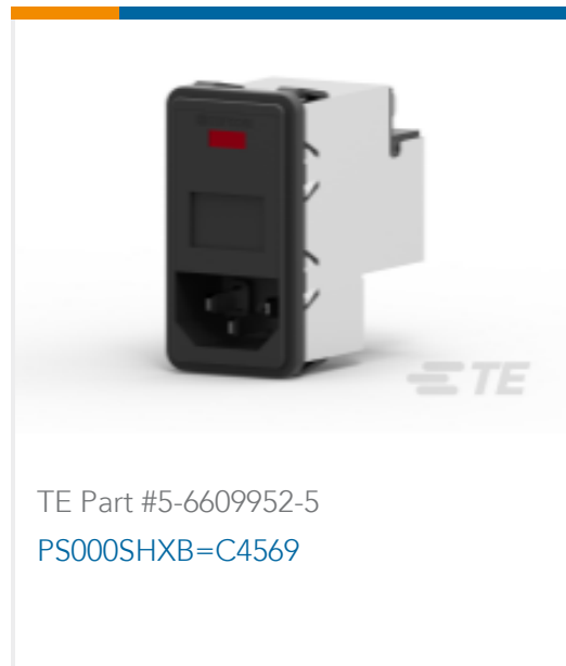
TE Part #5-6609952-5 PS000SHXB=C4569