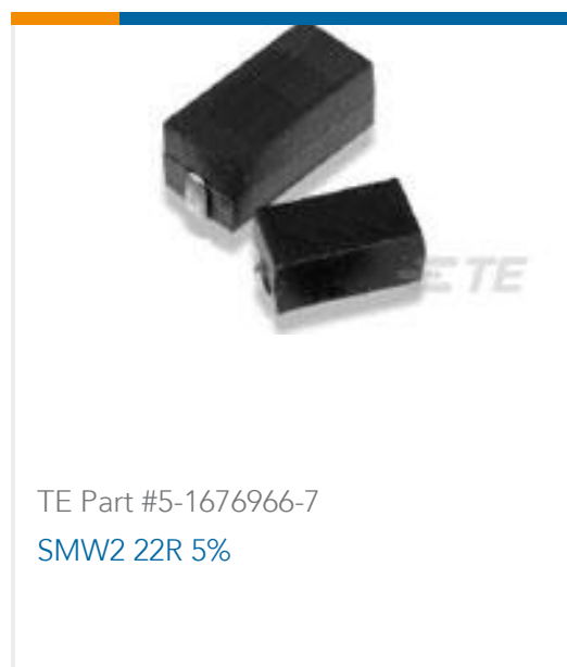
TE Part #5-1676966-7 SMW2 22R 5%