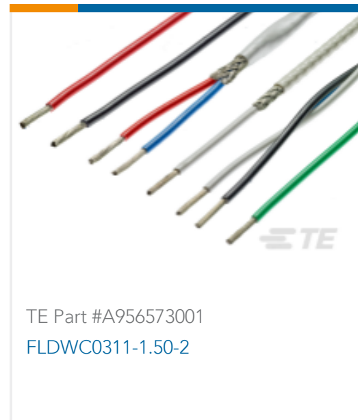
TE Part #A956573001 FLDWC0311-1.50-2