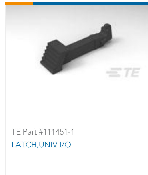
TE Part #111451-1 LATCH,UNIV I/O