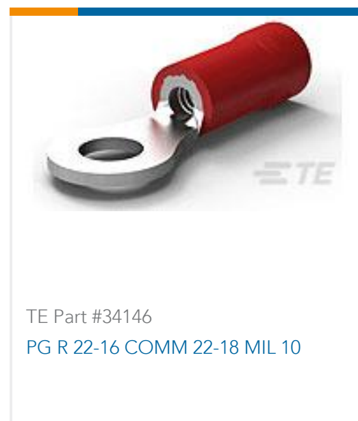
TE Part #34146 PG R 22-16 COMM 22-18 MIL 10