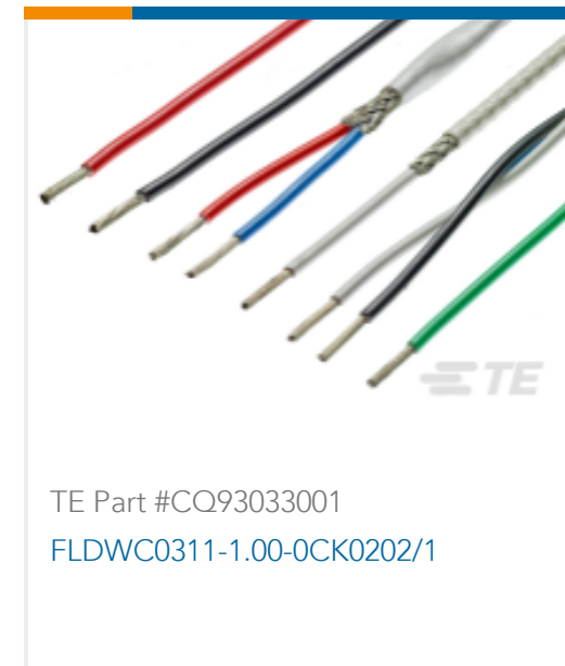
TE Part #CQ93033001 FLDWC0311-1.00-0CK0202/1