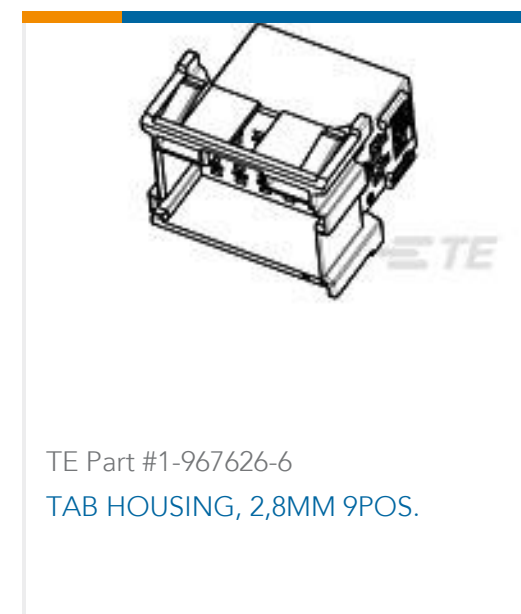
TE Part #1-967626-6 TAB HOUSING, 2,8MM 9POS.