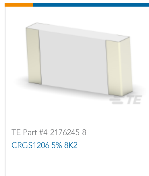
TE Part #4-2176245-8 CRGS1206 5% 8K2