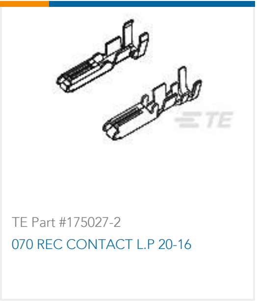
TE Part #175027-2 070 REC CONTACT L.P 20-16