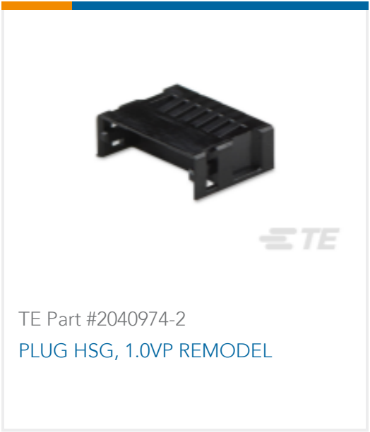
TE Part #2040974-2 PLUG HSG, 1.0VP REMODEL