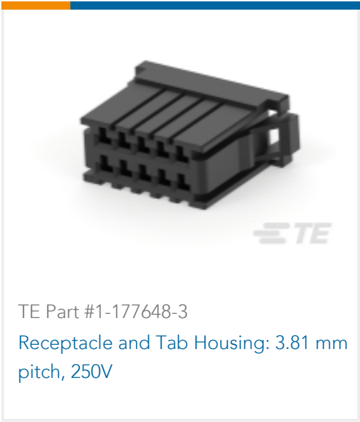
TE Part #1-177648-3 Receptacle and Tab Housing: 3.81 mm pitch, 250V