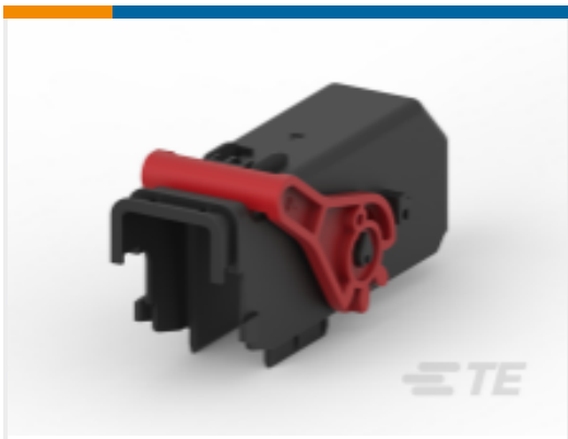
TE Part #1452920-1 30 POS CONNECTOR COVER ASSY