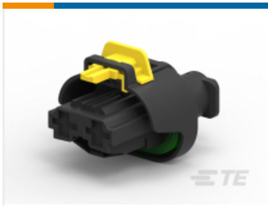
TE Part #1544650-1 PC 2V 8NG1 NOIR JT