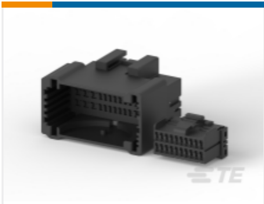
TE Part #1318825-7 MULTILOCK, CONNECTOR HOUSING