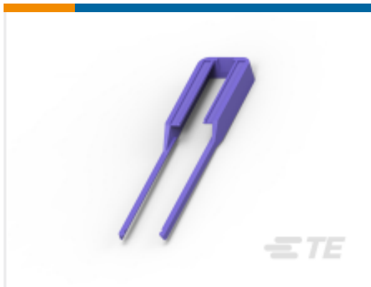
TE Part #1534358-1 RETAINER