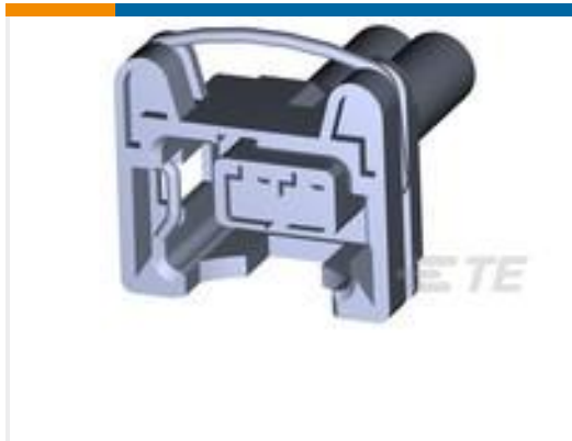
TE Part #1-85202-3 JPT 2P ASSY D/GRAY CODE B