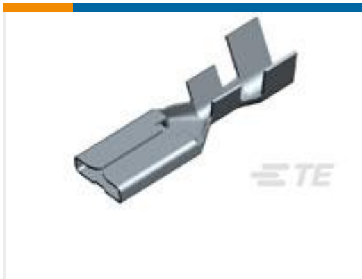
TE Part #1544964-1 8MM NG1+ TERMINAL