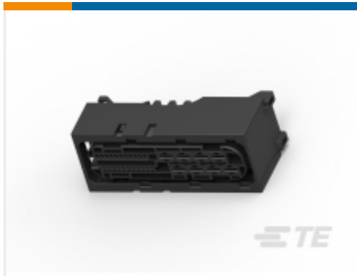
TE Part #1452915-2 30POS MIXED MQS REC SEALED