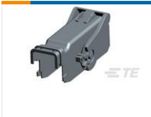
TE Part #1-1452920-1 COVER ASSY FOR 30 POS EPB CONN