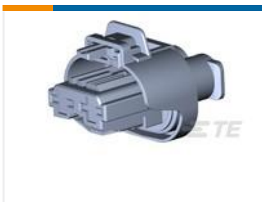
TE Part #1544650-3 PC 2V 8NG1 GRIS JT