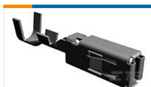
TE Part #1-968857-3 AMP MCP 2.8, CONTACT SWS