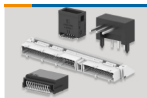
PCB Headers &amp; Receptacles(144)