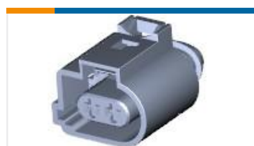
TE Part #2-1355200-2 MCP2,8REC HSG ASY2P