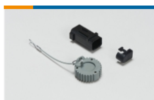
Automotive Connector Caps &amp; Covers (6)