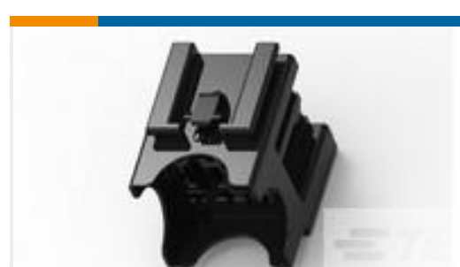
TE Part #1801618-1 RELAY 40A HOLDER