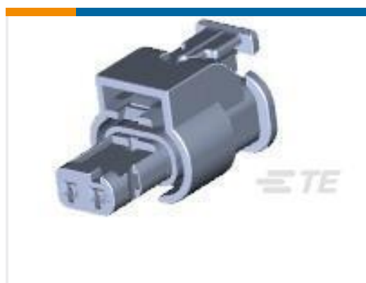
TE Part #1-1718643-4 2POS, MCON 1.2 LL REC SEALED