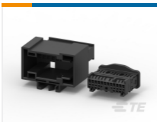
TE Part #965601-2 MQS, CONNECTOR HOUSING