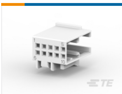
TE Part #2-2177198-1 COVER,10 POS. MQS,NA