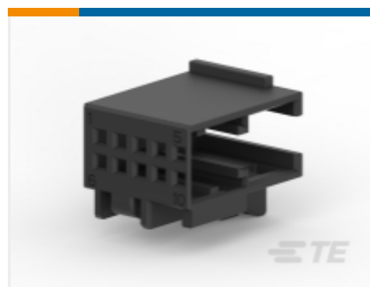
TE Part #1-2177198-1 COVER,10 POS. MQS,BL