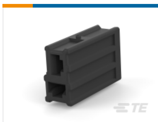
TE Part #626064-5 ISOLADOR