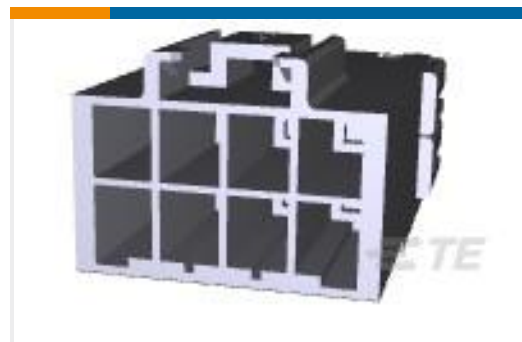
TE Part #179467-1 AMP POWER DBL LOCK CAP HSG 8P