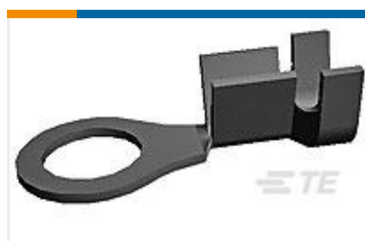
TE Part #170011-8 RING STRIP 18-14 MM2 0.503 X 11.938 TPBR