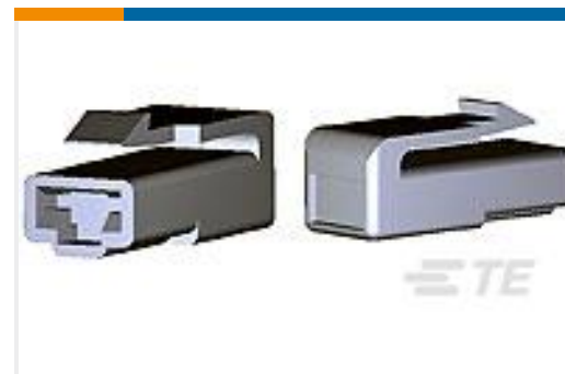
TE Part #172128-1 FF 250 REC HSG 1P NYLON NAT