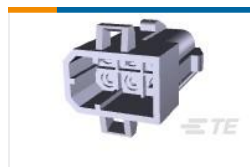
TE Part #171383-1 6 CIRCUIT M-N-L CAP