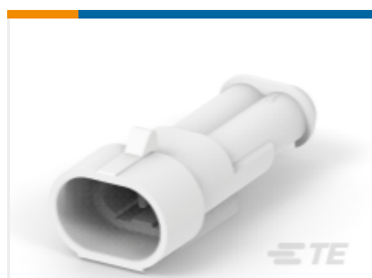
TE Part #1745099-1 AMP SUPERSEAL 1,5 SRS. 2 POS. TAB ASS'Y