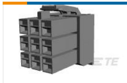
TE Part #176276-1 AMP UNIVERSAL POWER PLUG 9P