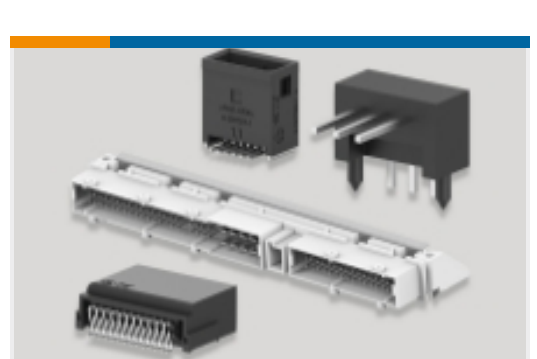
PCB Headers & Receptacles(144)