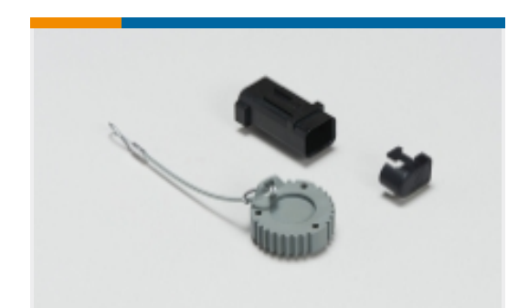
Automotive Connector Caps & Covers (6)