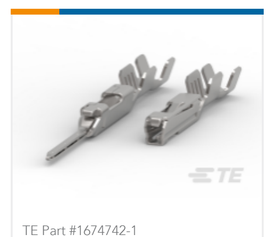
TH/.025 CONNECTOR SYSTEM, RECPT AND TAB