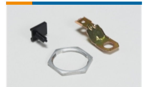
Other Automotive Connector Accessories(5)