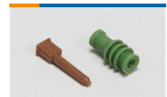
Automotive Seals & Cavity Plugs(2)