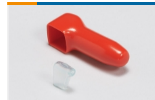
Insulation Boots & Sleeves(4)