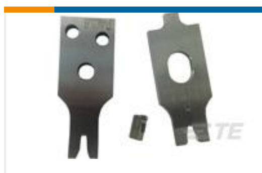
TE Part #7-2151353-7 OCEAN_2.0_SPARE_PART_KIT-070F090BX