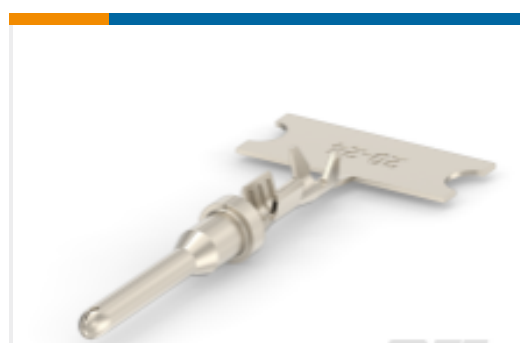
TE Part #5-2600020-2 XRC PIN TERMINAL 20-24AWG Ni Plated