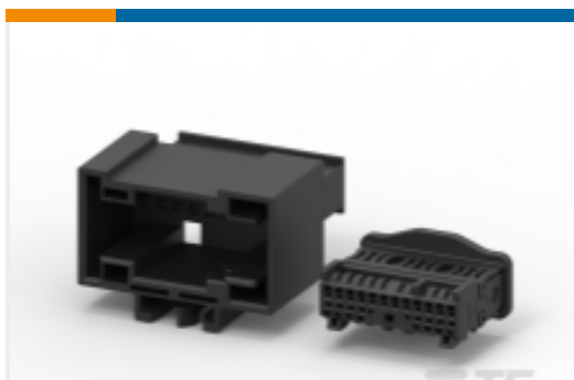
TE Part #2209477-1 MQS, CONNECTOR HOUSING