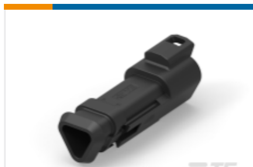
TE Part #2600026-3 3CCT BLACK RECEP W/SMALL SEAL & HS