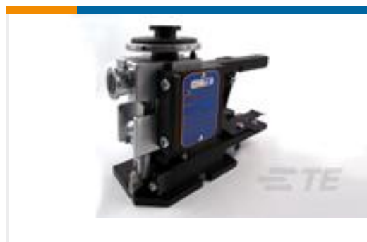
TE Part #2150237-1 OCEAN_2.0_APPLICATOR-E-130F2100