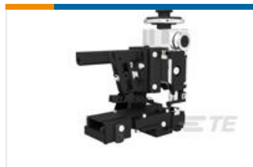
TE Part #2151353-1 OCEAN_2.0_APPLICATOR-S-070F090BX