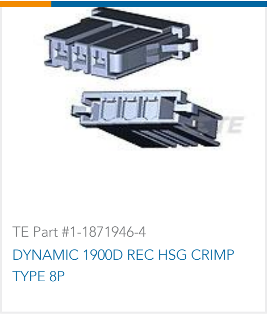
TE Part #1-1871946-4 DYNAMIC 1900D REC HSG CRIMP TYPE 8P