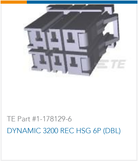
TE Part #1-178129-6 DYNAMIC 3200 REC HSG 6P (DBL)