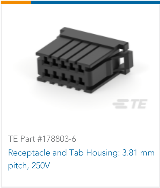
TE Part #178803-6 Receptacle and Tab Housing: 3.81 mm pitch, 250V