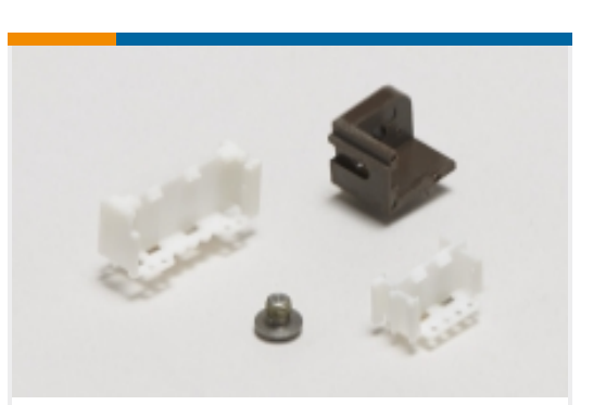
PCB Connector Mounting(8)