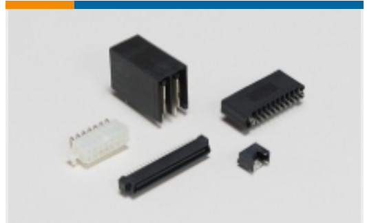
Standard Rectangular Connectors(2)