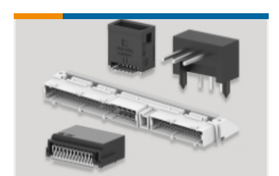
PCB Headers & Receptacles(283)