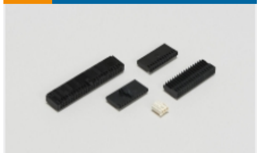
Wire-to-Board Connector Assemblies & Housings(152)