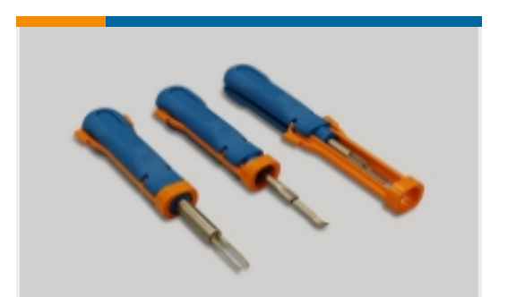
Insertion & Extraction Tools(1)