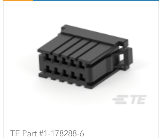
Receptacle and Tab Housing: 3.81 mm pitch, 250V