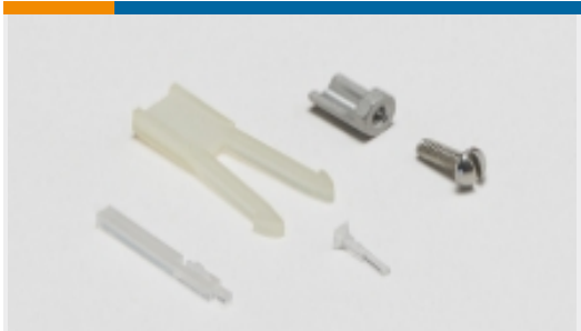
PCB Connector Keying(1)