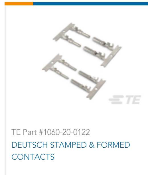
TE Part #1060-20-0122 DEUTSCH STAMPED & FORMED CONTACTS