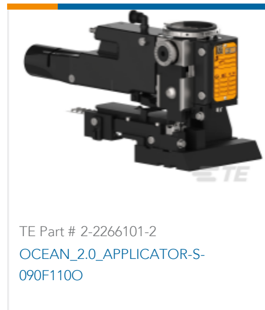
TE Part # 2-2266101-2 OCEAN_2.0_APPLICATOR-S-090F110O