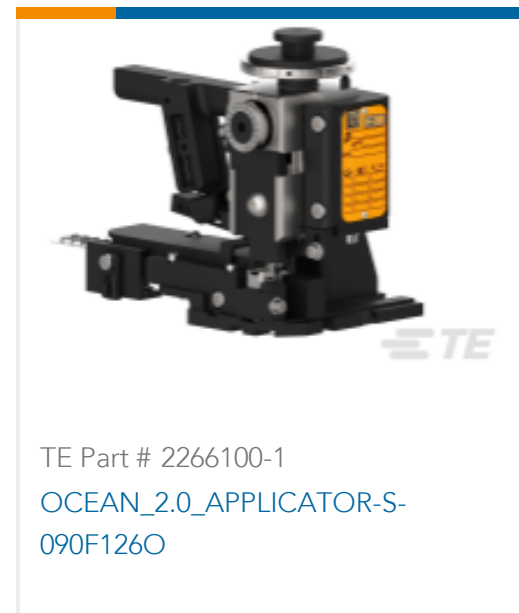
TE Part # 2266100-1 OCEAN_2.0_APPLICATOR-S-090F126O