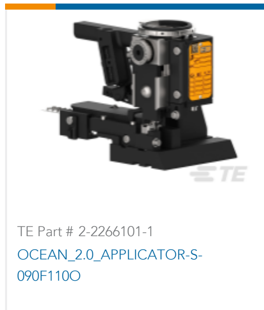
TE Part # 2-2266101-1 OCEAN_2.0_APPLICATOR-S-090F110O