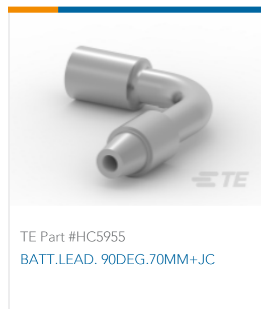
TE Part #HC5955 BATT.LEAD. 90DEG.70MM+JC