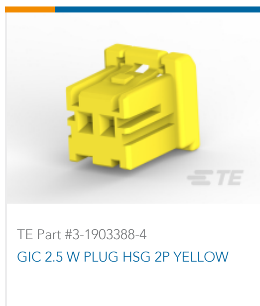
TE Part #3-1903388-4 GIC 2.5 W PLUG HSG 2P YELLOW