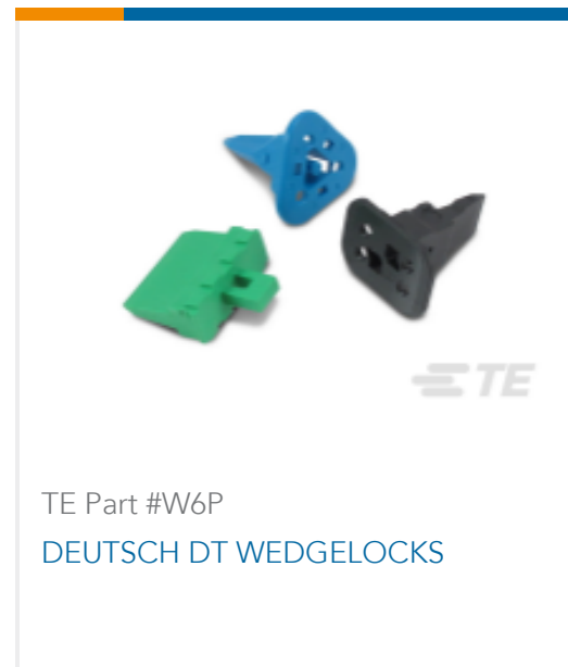
TE Part #W6P DEUTSCH DT WEDGELOCKS