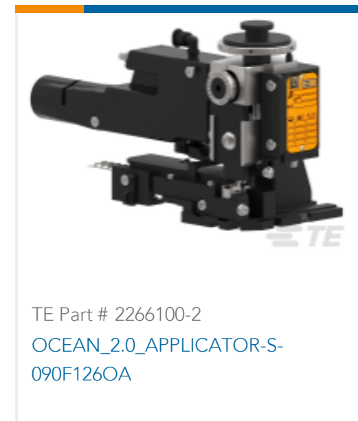
TE Part # 2266100-2 OCEAN_2.0_APPLICATOR-S-090F126OA