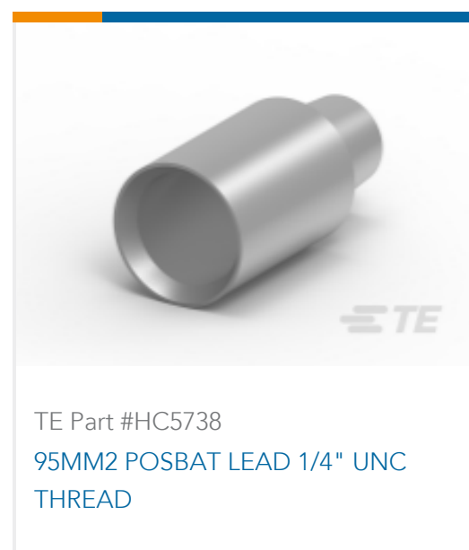
TE Part #HC5738 95MM2 POSBAT LEAD 1/4" UNC THREAD