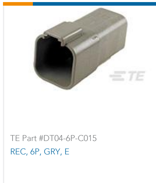
TE Part #DT04-6P-C015 REC, 6P, GRY, E