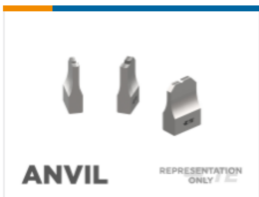
ANVIL REPRESENTATION ONLY