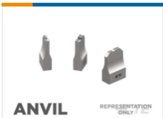
ANVIL REPRESENTATION ONLY