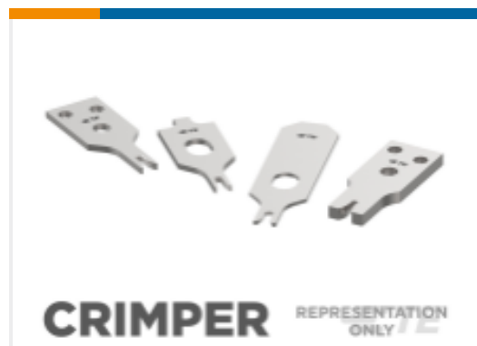
CRIMPER REPRESENTATION ONLY