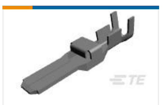
TE Part #917803-2 DYNAMIC D-5 TAB CONT. M AU