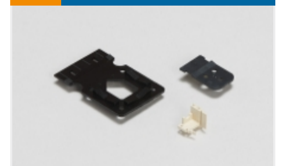
PCB Connector Strain Relief(2)