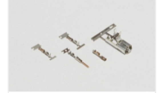
Wire-to-Board Connector Contacts(43)