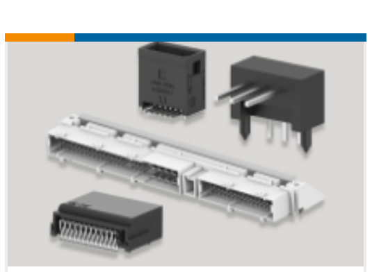
PCB Headers & Receptacles(59)