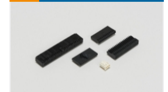
Wire-to-Board Connector Assemblies & Housings(71)