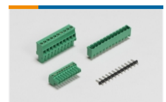
PCB Terminal Blocks(6)