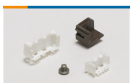
PCB Connector Mounting(3)